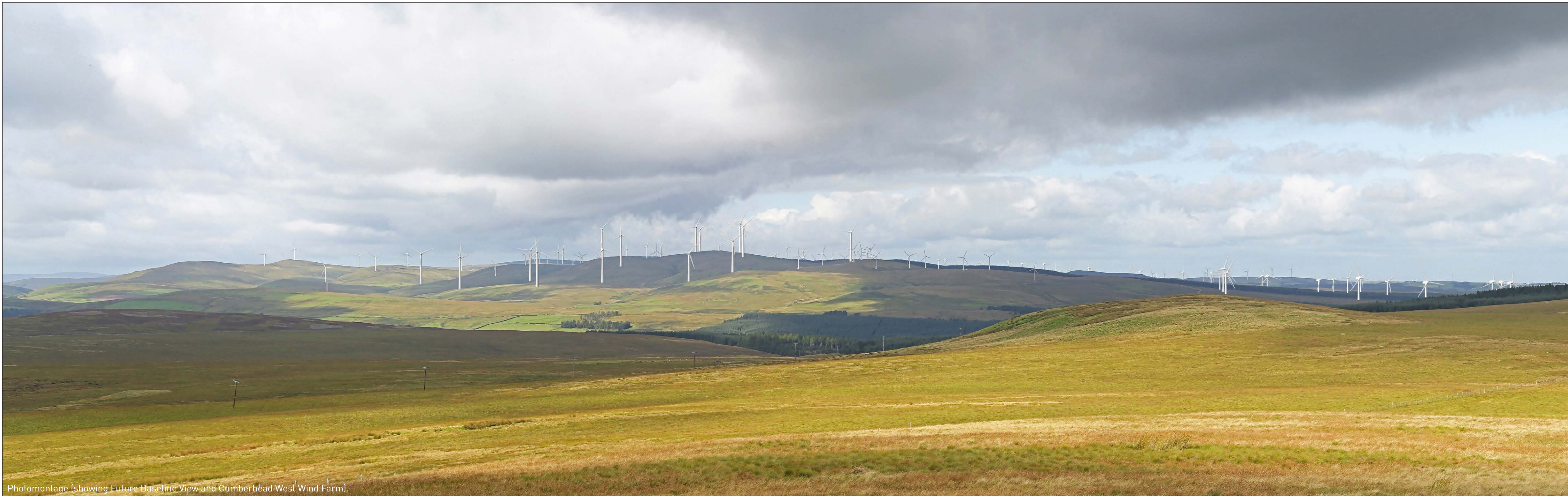
Photomontage (showing Future Baseline View and Cumberhead West Wind Farm).