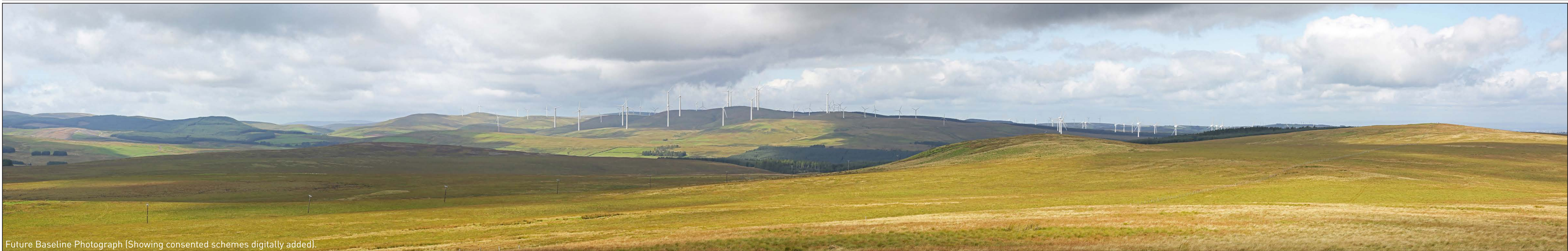
Future Baseline Photograph [Showing consented schemes digitally added].